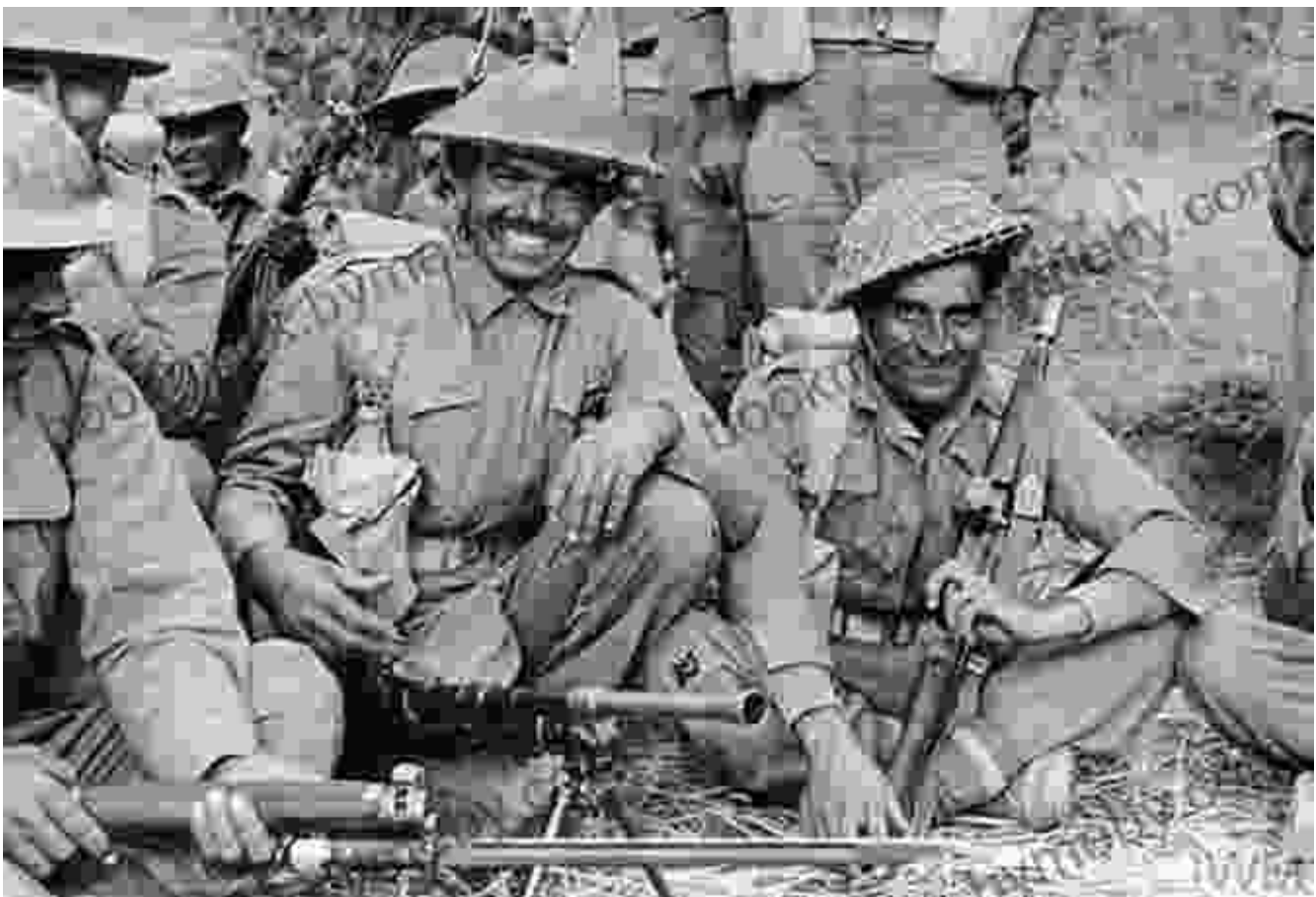
Indian soldiers in the Burma campaign

The Burma campaign was one of the most grueling and challenging theaters of operation in WWII. Indian soldiers fought tenaciously alongside British and American forces against a determined Japanese enemy. Raghavan follows the Indian troops through the treacherous jungles and mountains of Burma, capturing their resilience, camaraderie, and unwavering spirit.