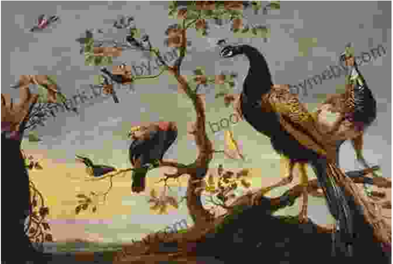
Louis Agassiz Fuertes, "Various Songbirds," watercolor and gouache on paper, c. 1900